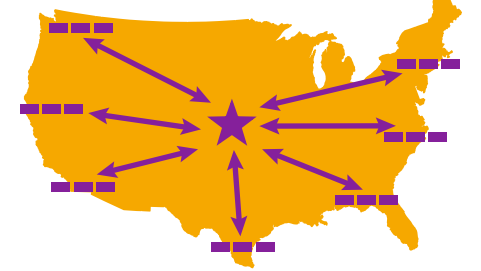
Ships or receives multiple cars to/from various points