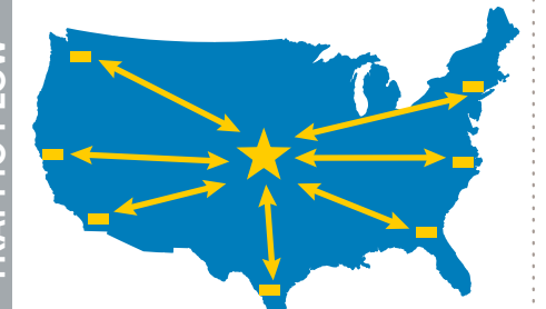
Ships or receives limited cars to/from multiple points