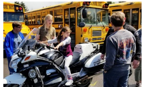
Children enjoy close-up views of a police motorcycle and other response vehicles.