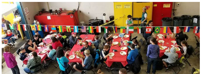
About 70 special needs students enjoy a fun-filled day of activities — and pizza.