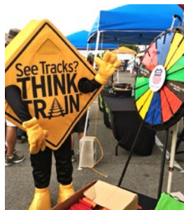
Community members, families and kids stop by UP's booth for fun games and giveaways.