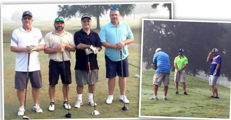
Palestine, Texas, hosts an annual golf outing benefiting UPEC Friend to Friend Network.