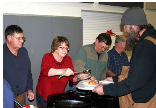
Club 8 members serve food during Donna's Christmas Dinner, a longtime North Platte tradition.