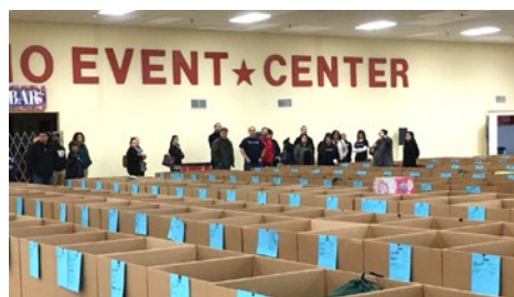
Club 66 members assemble holiday gift boxes for thousands of area youth.