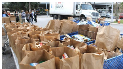
Food is bagged and ready for pickup.