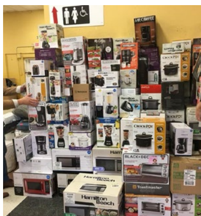
San Antonio seniors also benefit from the goodwill of the Salvation Army and Club 66.