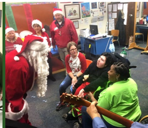
Attendees perform holiday carols for students.