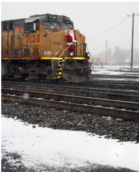
Santa's train arrives in La Grande, Ore., Dec. 20.