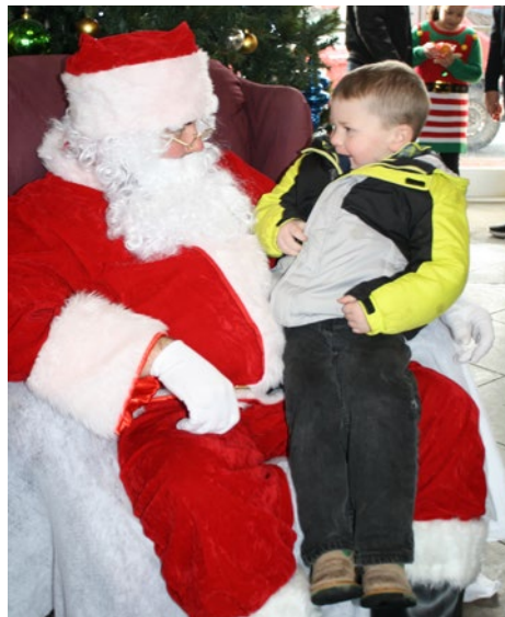
A child shares his wish list with Santa Claus.