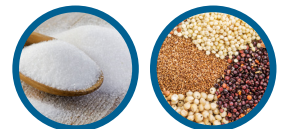
Rice, Sugar and Other Dry Goods