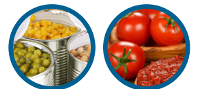
Canned Goods and Tomato Products